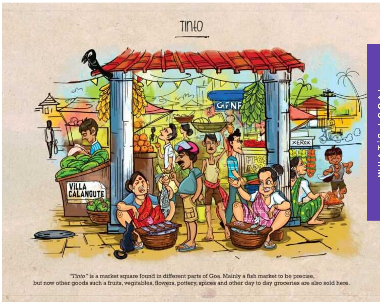
"Tinto" is a market square found in different parts of Goa. Mainly a fish market to be precise, but now other goods such as fruits, vegetables, flowers, pottery, spices and other day to day groceries are also sold here.