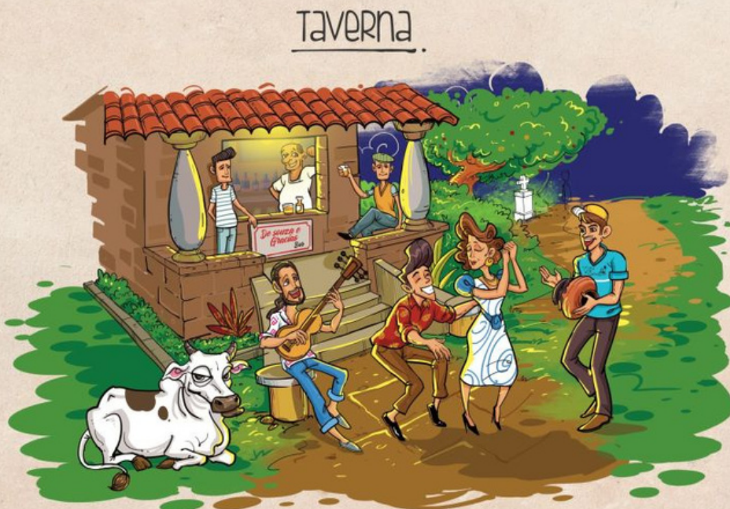
A taverna is a small cosy local bar that serves drinks. Culturally, people gather here in the evening after a long days work to gossip, talk about the seasonal crops and local weather. Villagers often jam, play music, sing, dance and enjoy local drinks such as a 'copito' of 'cashew feni' or 'urak'.