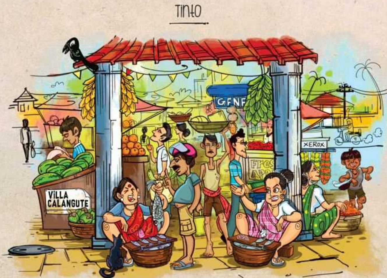
"Tinto" is a market square found in different parts of Goa. Mainly a fish market to be precise, but now other goods such as fruits, vegetables, flowers, pottery, spices and other day to day groceries are also sold here.