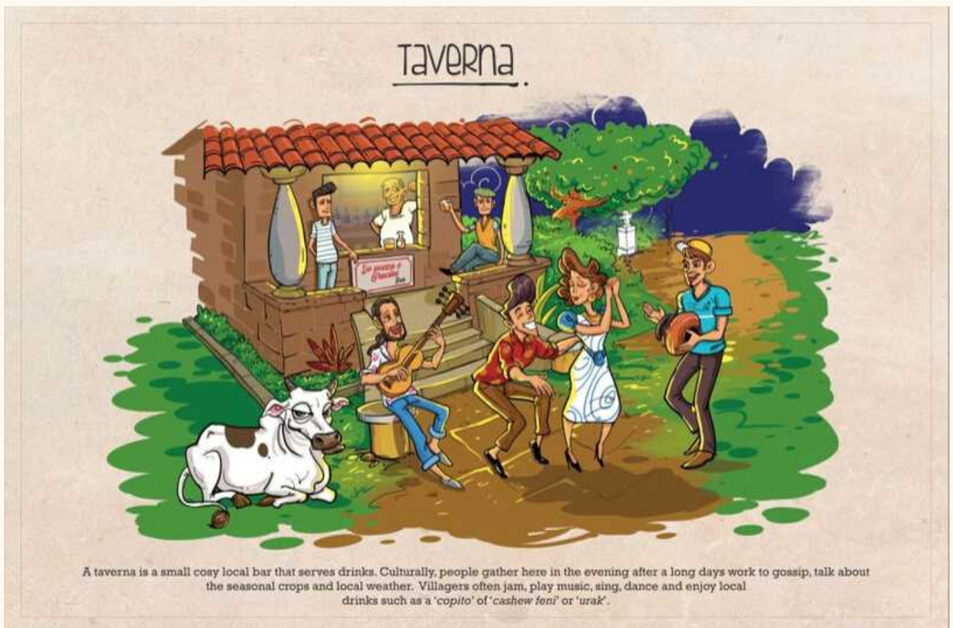
A taverna is a small cosy local bar that serves drinks. Culturally, people gather here in the evening after a long days work to gossip, talk about the seasonal crops and local weather. Villagers often jam, play music, sing, dance and enjoy local drinks such as a 'copito' of 'cashew feni' or 'urak'.