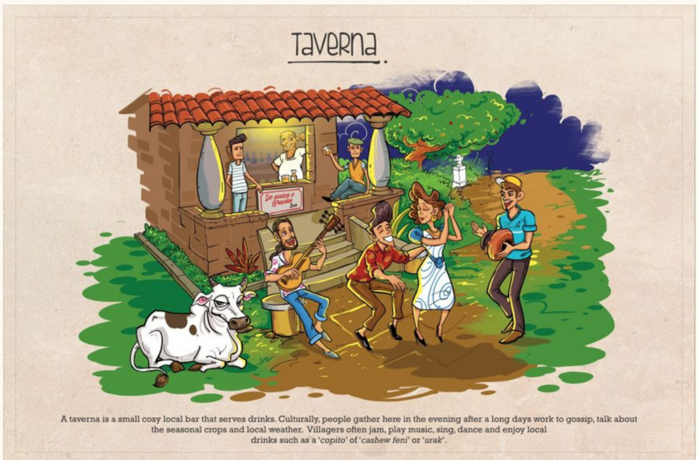
A taverna is a small cosy local bar that serves drinks. Culturally, people gather here in the evening after a long days work to gossip, talk about the seasonal crops and local weather. Villagers often jam, play music, sing, dance and enjoy local drinks such as a 'copito' of 'cashew feni' or 'urak'.