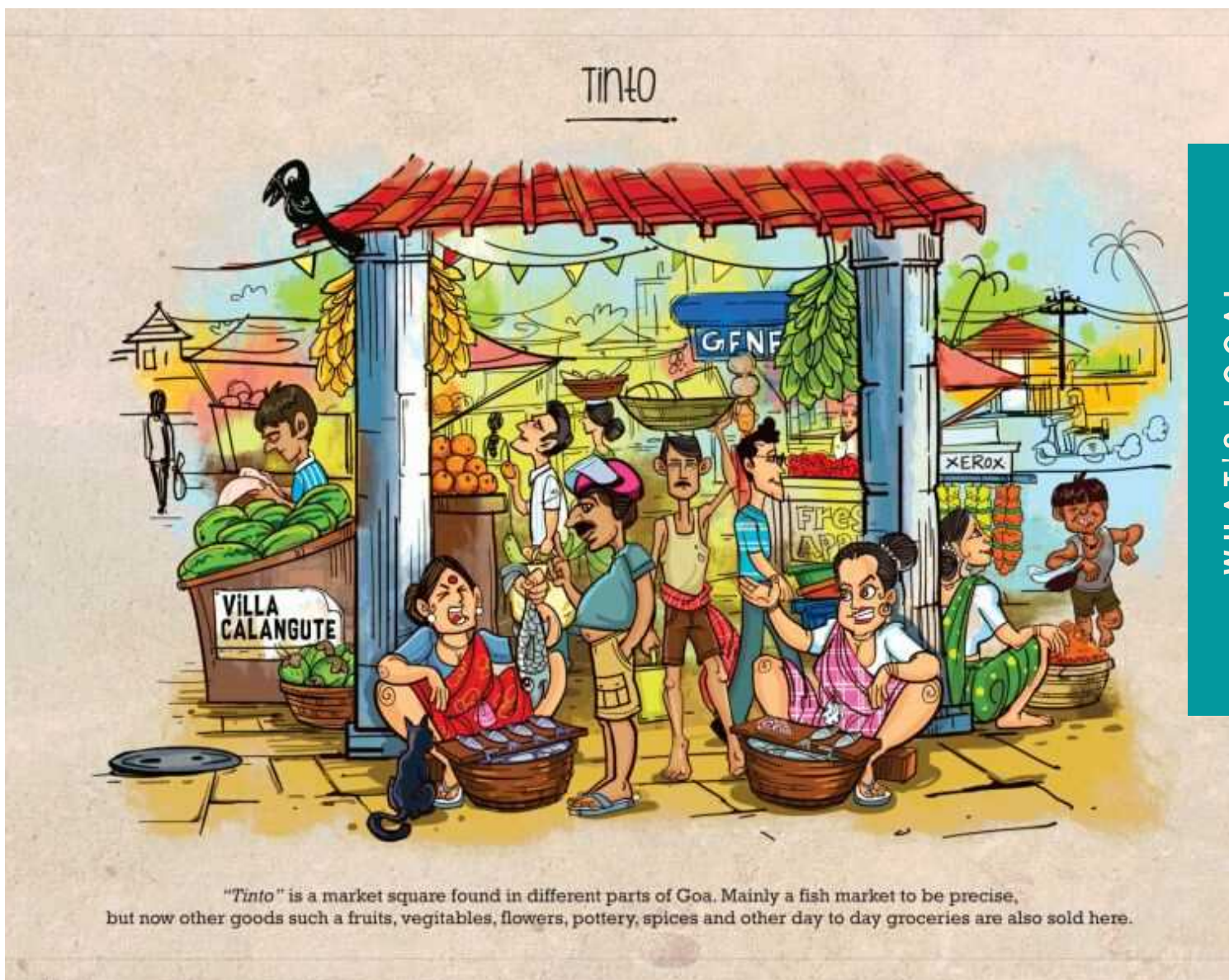
"Tinto" is a market square found in different parts of Goa. Mainly a fish market to be precise, but now other goods such as fruits, vegetables, flowers, pottery, spices and other day to day groceries are also sold here.