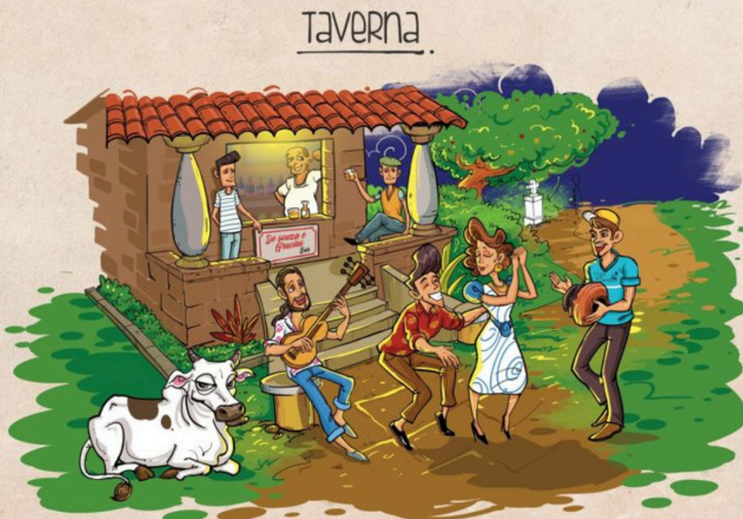
A taverna is a small cosy local bar that serves drinks. Culturally, people gather here in the evening after a long days work to gossip, talk about the seasonal crops and local weather. Villagers often jam, play music, sing, dance and enjoy local drinks such as a 'copito' of 'cashew feni' or 'urak'.