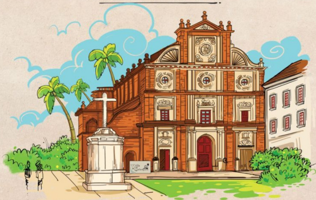
The Basilica of Bom Jesus is over 400 hundred years old and is one of the oldest churches in the world. It is a UNESCO World Heritage Site. It houses the glass tomb with the mortal remains of St. Francis Xavier, the patron saint of Goa.