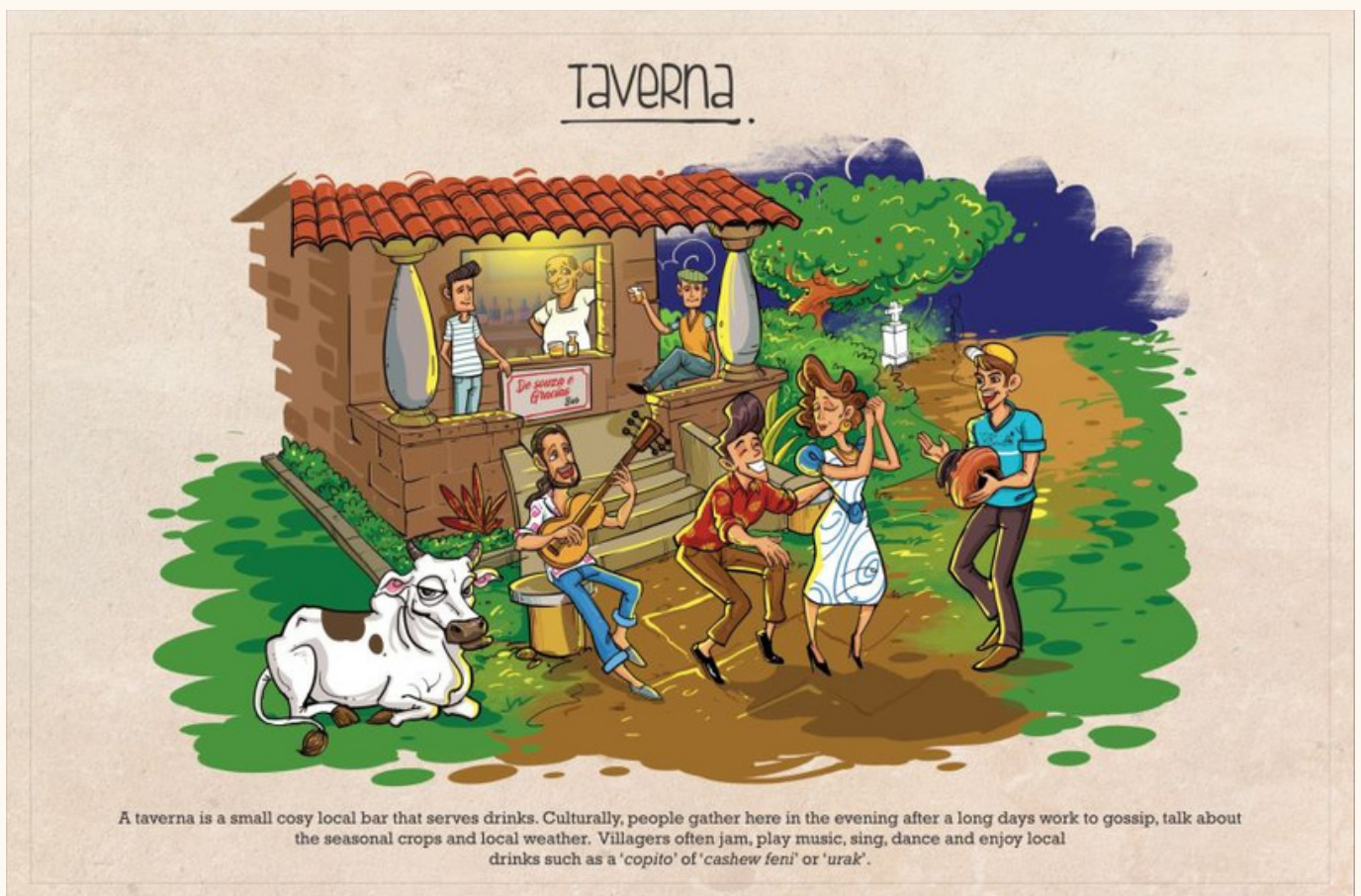
A taverna is a small cosy local bar that serves drinks. Culturally, people gather here in the evening after a long days work to gossip, talk about the seasonal crops and local weather. Villagers often jam, play music, sing, dance and enjoy local drinks such as a 'copito' of 'cashew feni' or 'urak'.