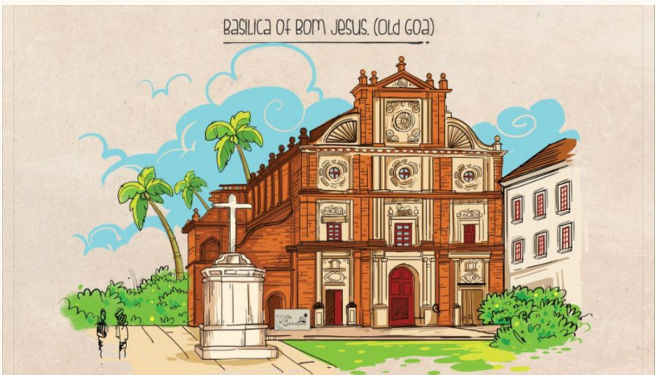
The Basilica of Bom Jesus is over 400 hundred years old and is one of the oldest churches in the world. It is a UNESCO World Heritage Site. It houses the glass tomb with the mortal remains of St. Francis Xavier, the patron saint of Goa.

Spice Plantations: Spices were the wealth that attracted the Portuguese and Goa still boasts of spice plantations occupying acres of land. See how pepper, tamarind, cardamom, cinnamon and other tropical spices are grown and buy little spice pouches to take back home from the plantation shop. The spice plantation is located in Ponda.